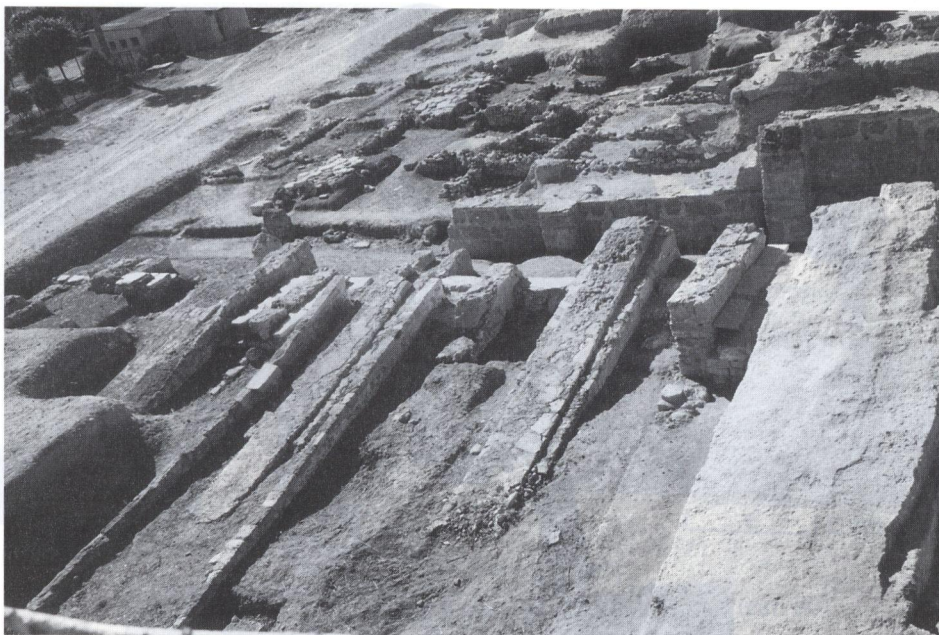
1. Kition. The neoria seen from the north. 1999.

The remains of the archaic sanctuary at the background were covered by the terrace of the classical period.