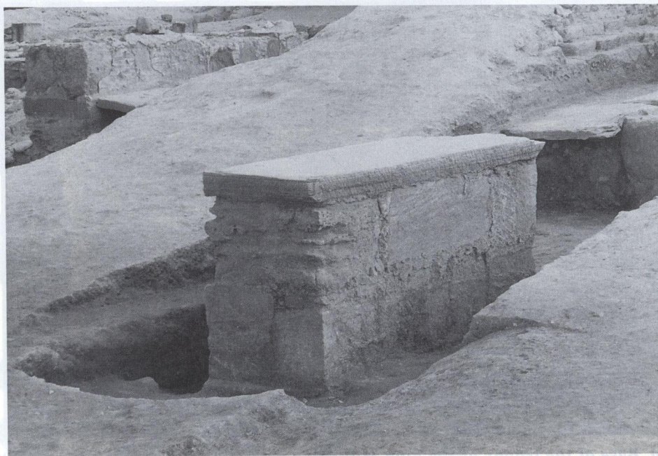
2. Kition. Base of the pillar 728. 1999.