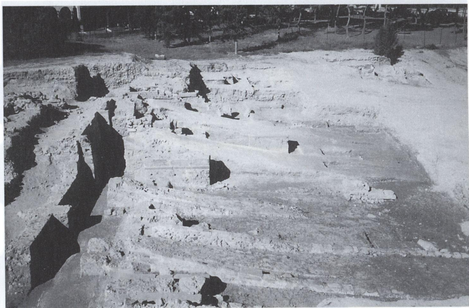
1. Kition. The neoria seen from the east (left: terrace wall 432). 1999.