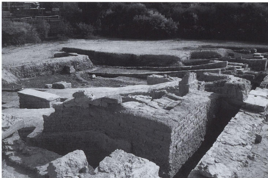
1. Kition. South-west corner of the neoria. 1999 Northern part of slip-way 731 seen from the south-west : phases 2 and 3.