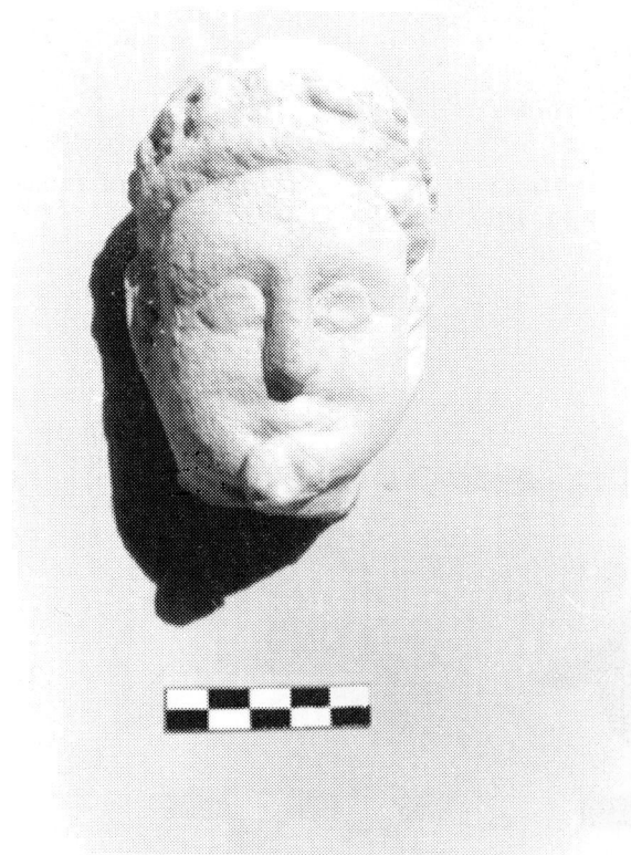
b. VPP 136.100. A limestone statuette head fragment of a flute-player. Pres. Ht. 11.0 cm.