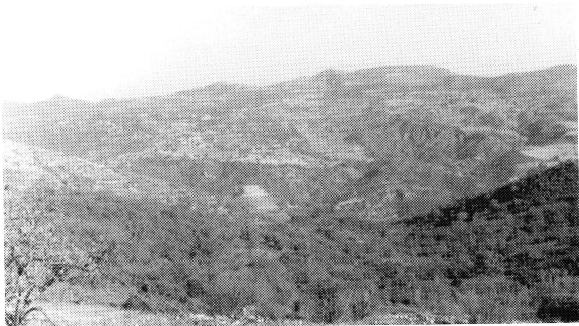
b. View from the site across the Ayiou Mina valley, to N.