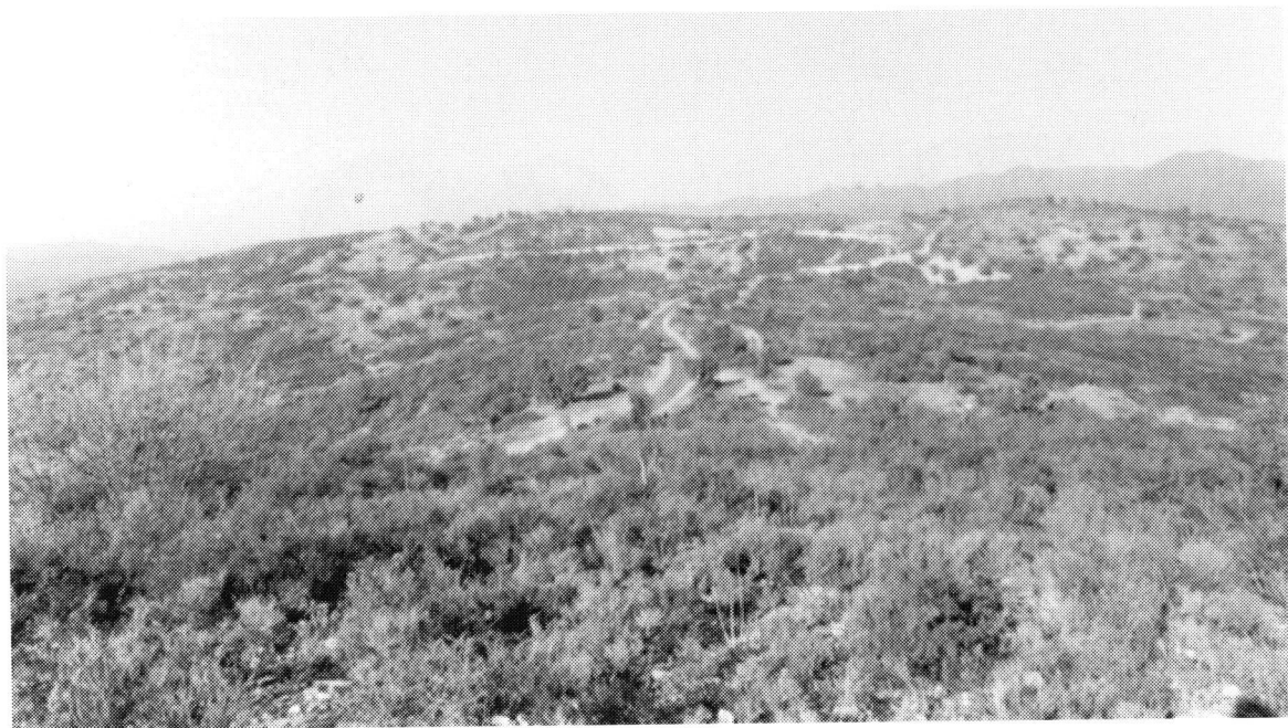
a. The sanctuary area, from SE. The site lies on either side of the road in the centre of the photograph.