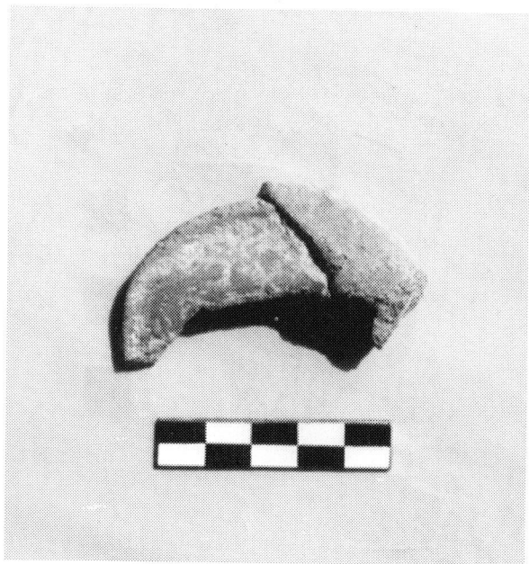
b. VVP 136.53 A life - size terracotta talon. Pres. L. 6.5 cm.