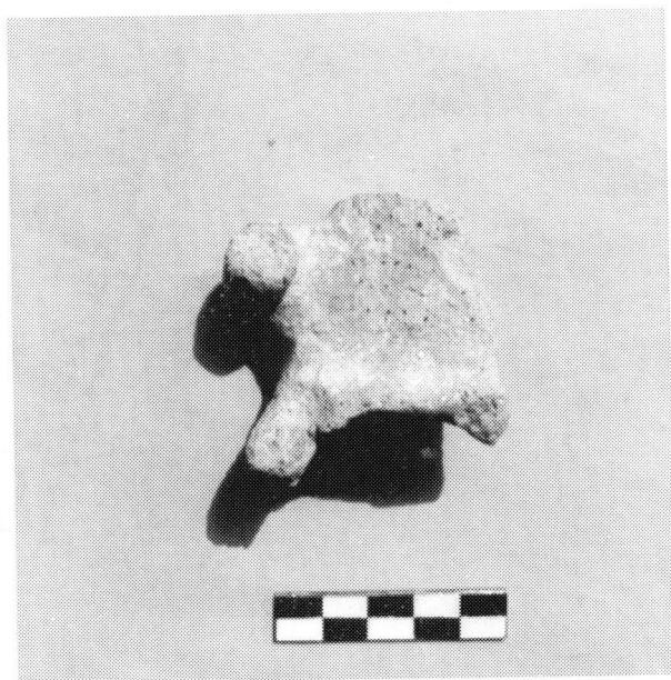
a. VVP 136.41. A terracotta figurine torso of a male rider. Pres. Ht. 6.25 cm.