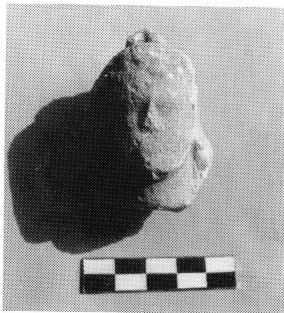
c. VVP 136.8. A limestone figurine head of the god Pan. Pres. Ht. 5.5 cm.