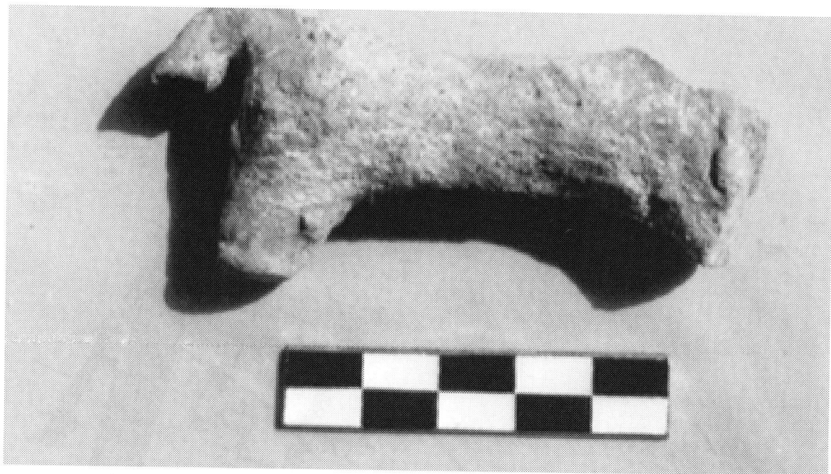
a. VVP 136.32. A terracotta figurine torso of a horse. The single rear leg suggests that it originally formed part of a chariot group. Pres. L. 7.5 cm.