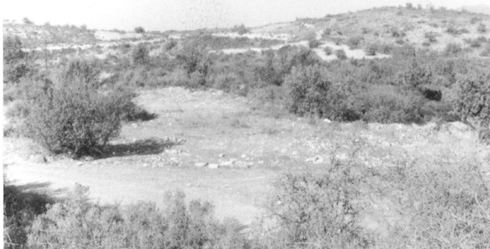
a. The looted sanctuary area at the south end of plot 322, from SE.