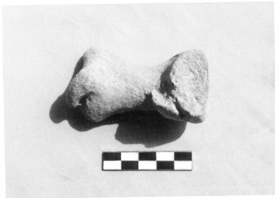
b. VVP 136.31. A terracotta figurine torso of a horse with traces of an attached rider. Pres. L. 8.0 cm.