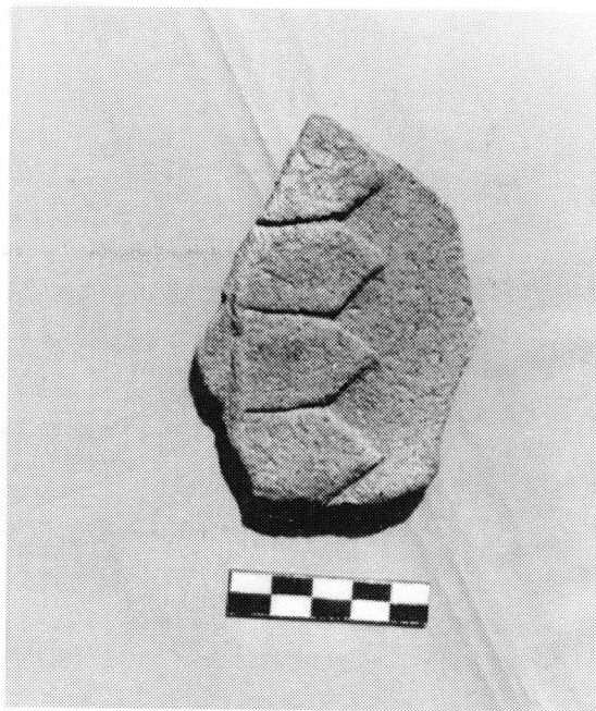
a. VVP 136.85. A terracotta statue fragment with detail of a strap. Pres. Ht. 9.6 cm.